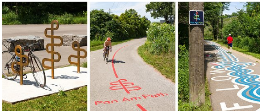
Implementation of branding and identity