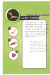
Special bugs wall case panel