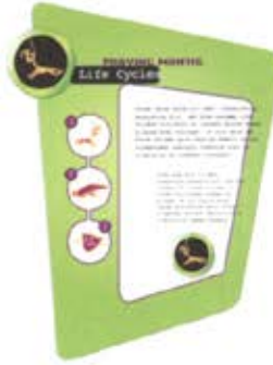
Dragonfly life cycle panel